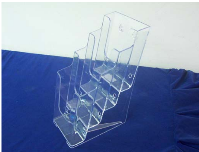
Four Tiers DL Brochure Holder Dimension : 105mm x 203mm x 254mm Unit Price : USD 2.19/pc

* MINIMUM ORDER QUANTITY - 5000 PCS EACH ITEM