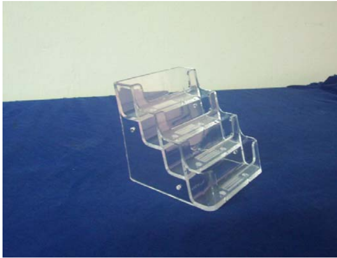
Four Tiers Business Card Holder