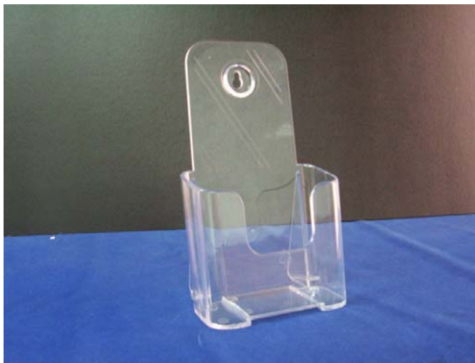
Single Pocket DL Brochure Holder Dimension : 111mm x 83mm x 197mm

* MINIMUM ORDER QUANTITY - 5000 PCS EACH ITEM