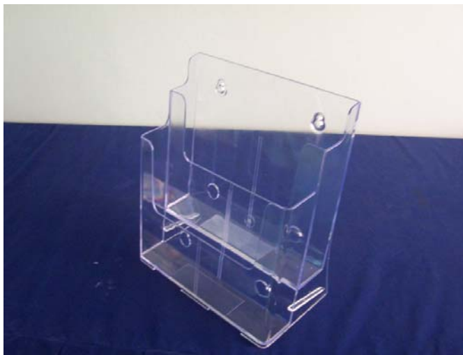
Two Tiers A4 Brochure Holder Dimension : 235mm x 127mm x 279mm

* MINIMUM ORDER QUANTITY - 5000 PCS EACH ITEM