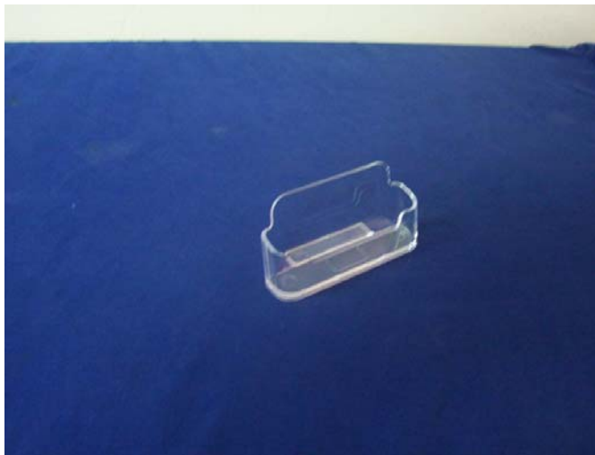
Business Card Holder

Single Pocket DL Attachment Dimension : 102mm x 121mm