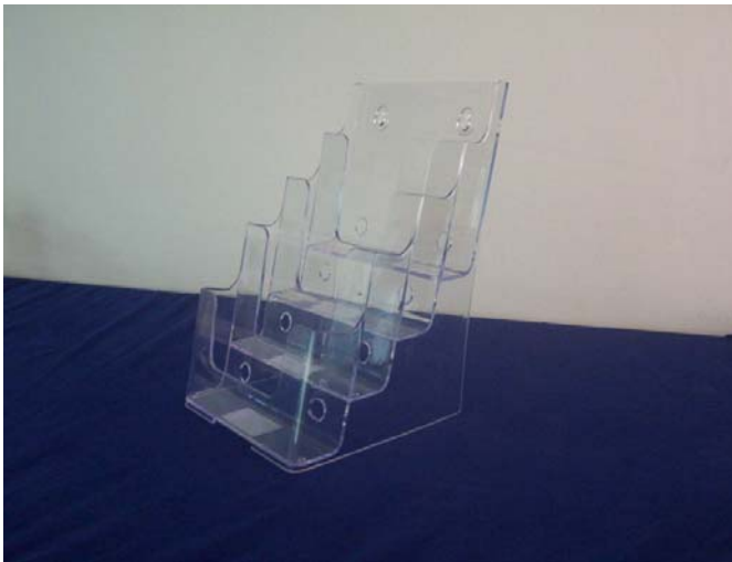
Four Tiers A5 Brochure Holder Dimension : 165mm x 203mm x 254mm

* MINIMUM ORDER QUANTITY - 5000 PCS EACH ITEM