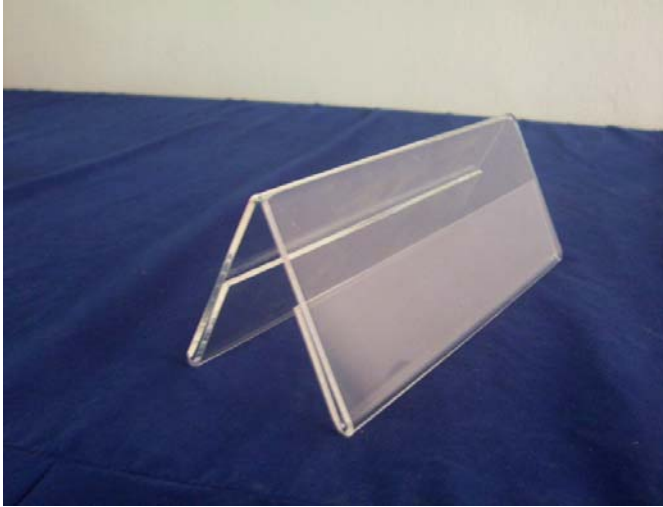
Plastic Name Tag Holder Dimension : 152mm x 102mm