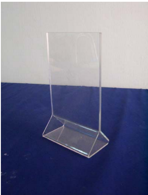
Plastic Y Style Menu Holder Dimension : 3.5" x 5"

* MINIMUM ORDER QUANTITY - 5000 PCS EACH ITEM