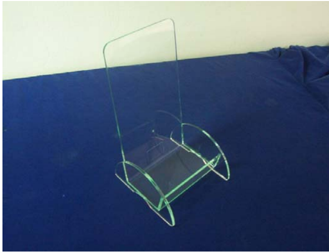
Acrylic Tinted DL Brochure Holder Dimension : 114mm x 95mm x 203mm