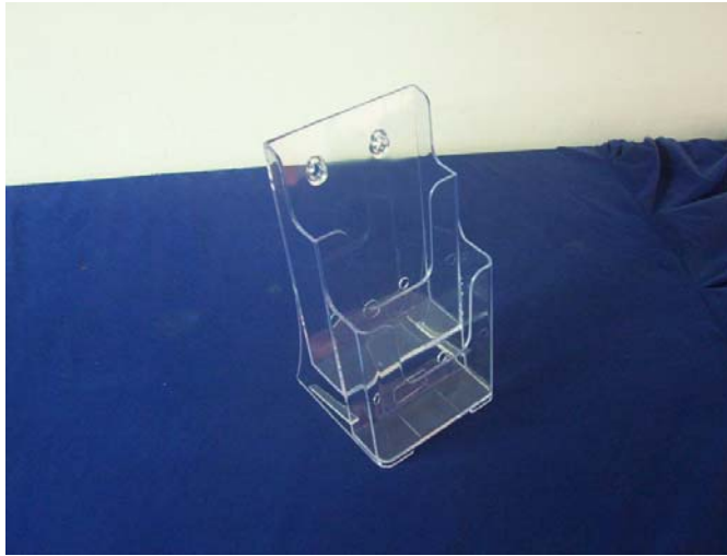
Two Tiers DL Brochure Holder Dimension : 111mm x 102mm x 203mm