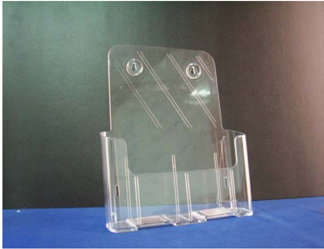
Single Pocket A4 Brochure Holder Dimension : 235mm x 95mm x 273mm