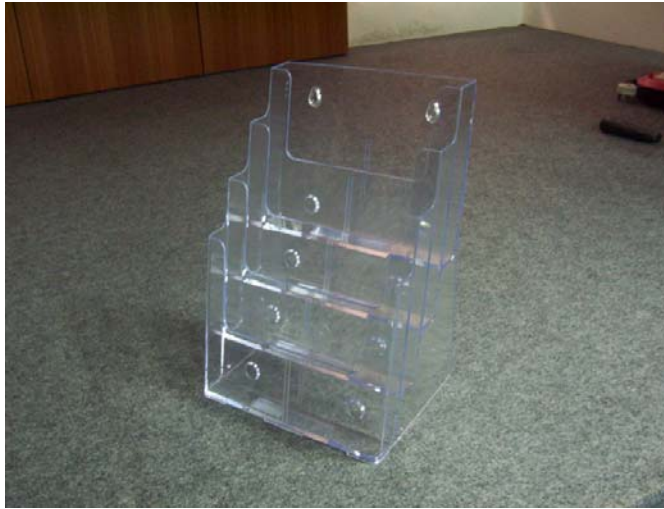
Four Tiers A4 Brochure Holder Dimension : 235mm x 178mm x 340mm