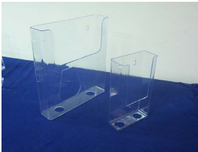
Wallmounted DL Brochure Holder Dimension : 105mm x 41mm x 178mm