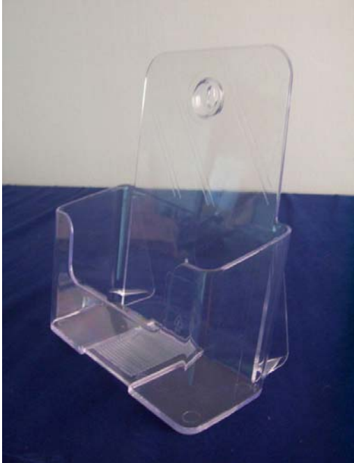
Single Pocket A5 Brochure Holder Dimension : 171mm x 95mm x 197mm